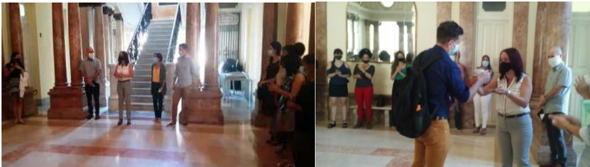
Award delivery at the closing ceremony