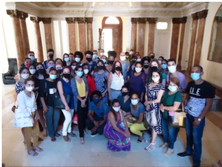
General group picture